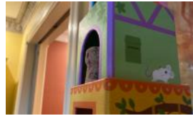
FOURTH FLOOR OF TWINKLE TOWER DAMAGED BY MISSILE