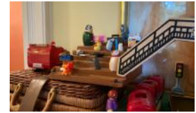
BRIDGE ALMOST EXPLODES, BUT MISSILE NOT AIMED CORRECTLY