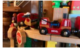
FIREFIGHTERS ON THE BINGO TRANSIT AUTHORITY ELEVATED TRACKS