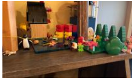
BINGO BOTANIC GARDEN OPEN TO PUBLIC! THE PARTY IS OVER